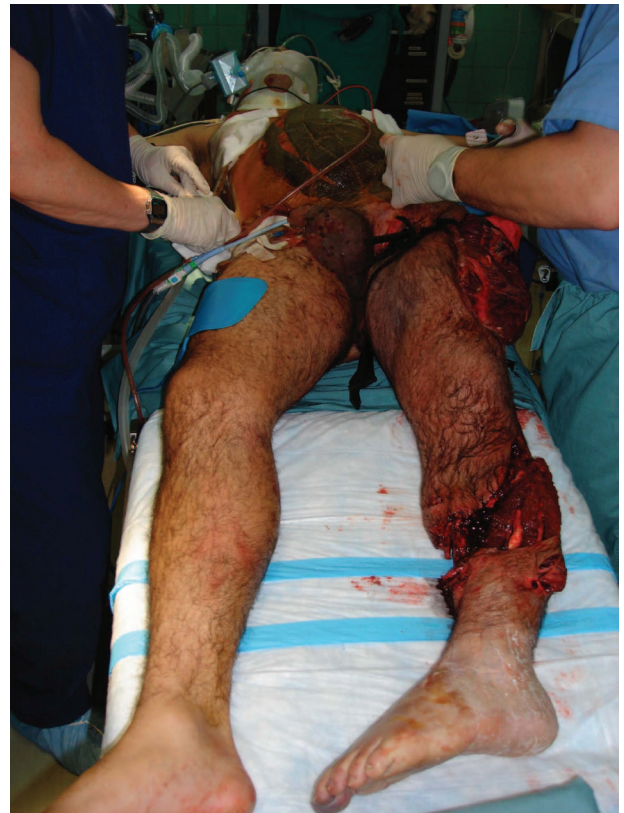
Fig. 2. Photograph of patient with multiple injuries and a tourniquet used on the thigh. The patient had a proximal femur fracture with femoral artery and vein transection and a near-complete below-knee amputation. The only left leg structures partially intact were in the deep posterior compartment. Other potentially lethal injuries required massive transfusion, emergency department thoracotomy and aortic cross clamping, open manual cardiac massage, three cardiac electroconversions, emergency laparotomy and ligation of the common iliac, femoral arteries and veins as hemorrhage control measures, and an intensive care unit respite to correct coagulopathy before the tourniquet could be attended and amputation done for the ischemic limb sequelae. This patient had a transfemoral amputation performed after 14 hours of tourniquet application. The patient survived.

428 tourniquet uses (97%). Tourniquets distal to the most proximal limb wound numbered five on four limbs in four patients; two of these four patients died. A tourniquet was placed atop the wound in another patient; this patient had the